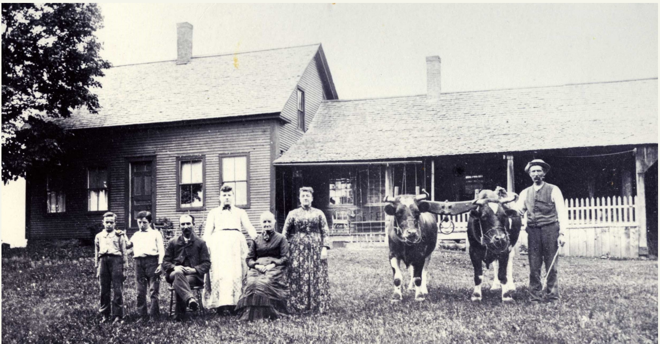
McMullen Family Farm next to Crossett Hill School