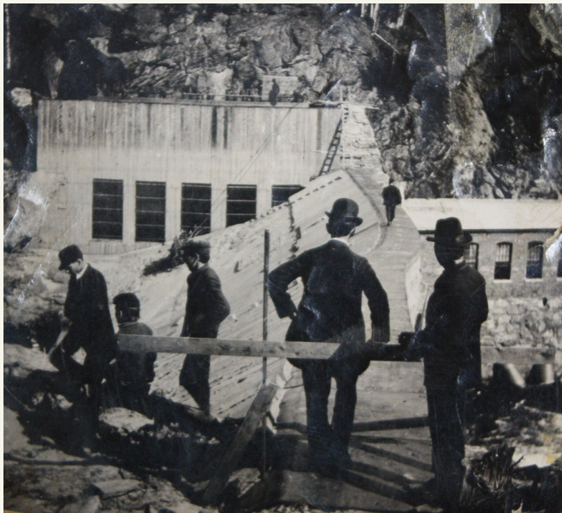
Foremen viewing the progress of construction.