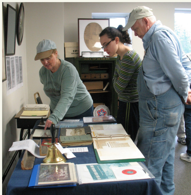
Open House