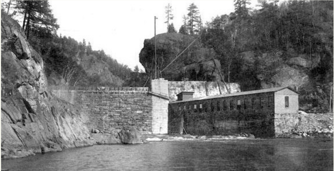
Original powerhouse prior to 1905/1906 expansion.

By 1903, more power was needed so a third turbine generator unit was added and the powerhouse was expanded in 1905/1906. The turbine was a 277 rpm 39" twin horizontal wheel manufactured by the Allis Chalmers Company.