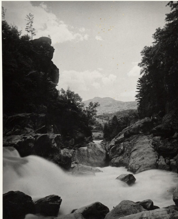
View of Camel's Hump from Bolton Falls prior to dam construction.