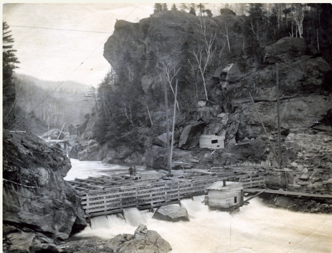
Original timber crib dam under construction.

The Waterbury Record reported in September of 1898 that 60 men were working at the falls, mostly Italians some Americans. In December of the same year, the count doubled and the target completion date was January 10, 1899.