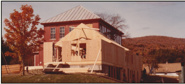
More photos of construction in progress.