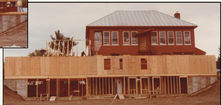
Photos of construction in progress.