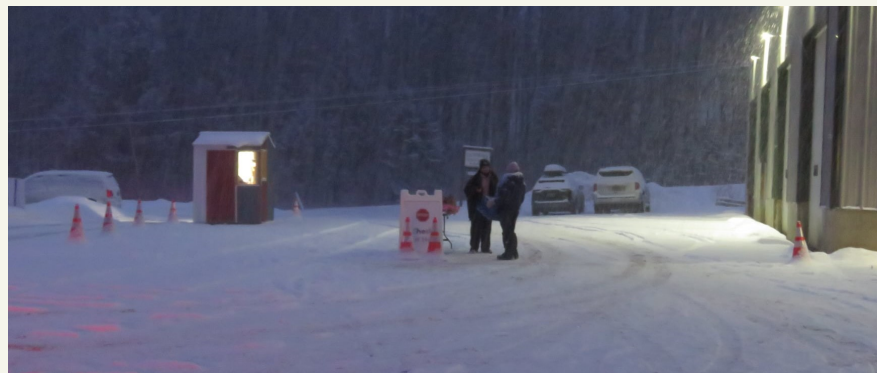
Maureen Harvey and Jill Smith braving the winter weather.

Town Meeting day was March 1, 2022. Thanks to our neighbors making it possible, folks had the option of voting from their cars in the Duxbury Town Office parking lot from 7 am-7 pm. As you can see from the photo below and the one on the next page, it was a snowy and cold day but everyone made the best of it.