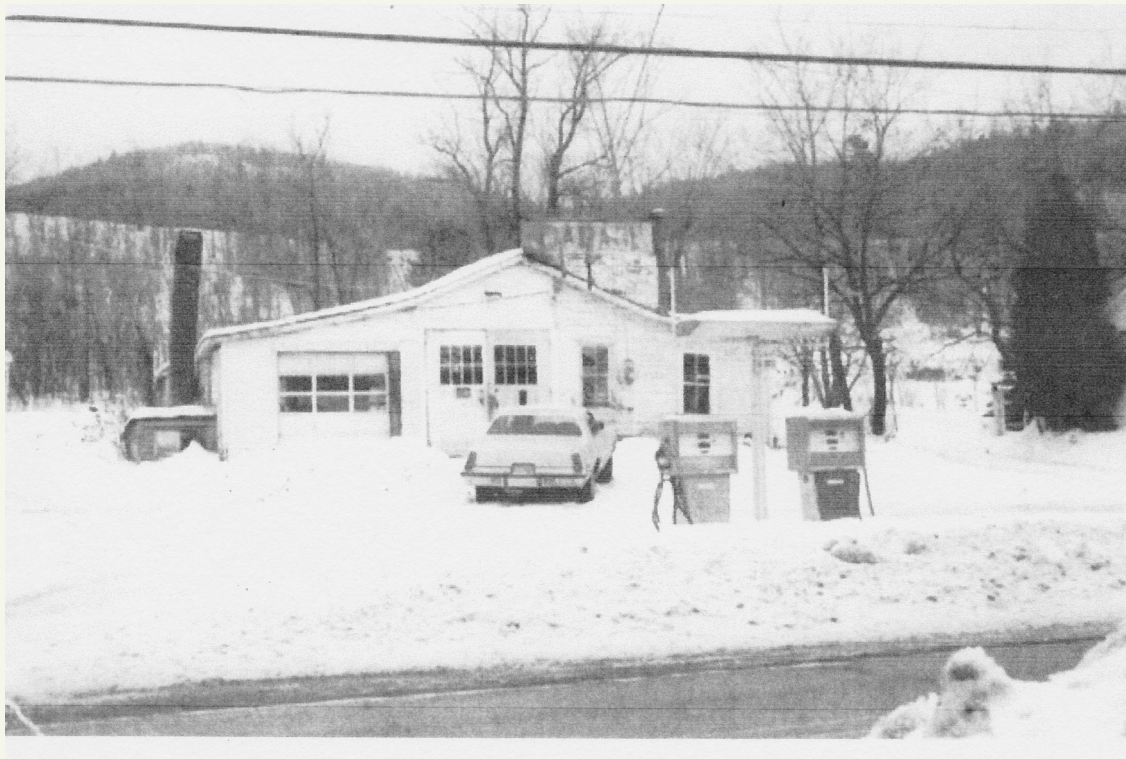
Allen's Garage on East Main Street in Richmond. Later torn down.