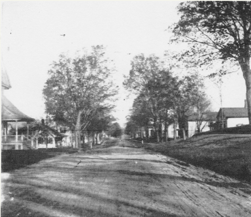
View looking towards Burlington up East Main Street in Richmond. The crash would have been at the far end of this view with Allen's Garage and the Averill house being located on the right—although not visible in this photograph.