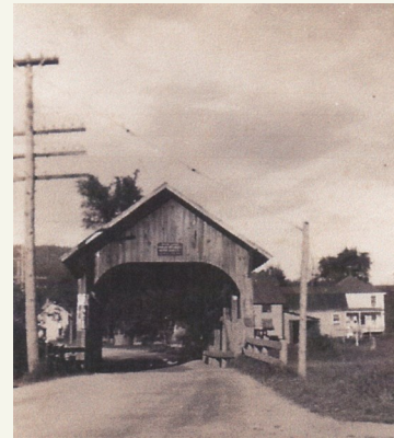
The covered bridge before the sign disappeared.