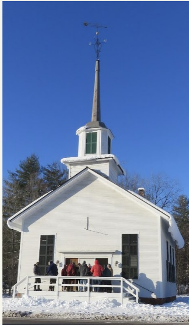
Attendees entering the church on December 21, 2022.

In early October the officers called a meeting attended by themselves and the trustees to start a plan for the big job ahead. Only a few specifics came from that meeting but important committees got started. The Building Committee was established: it includes the trustees helped by two other members. From the Building Committee sprang the Fundraising Committee that now includes three other willing Duxbury residents. Both of these committees have established regular