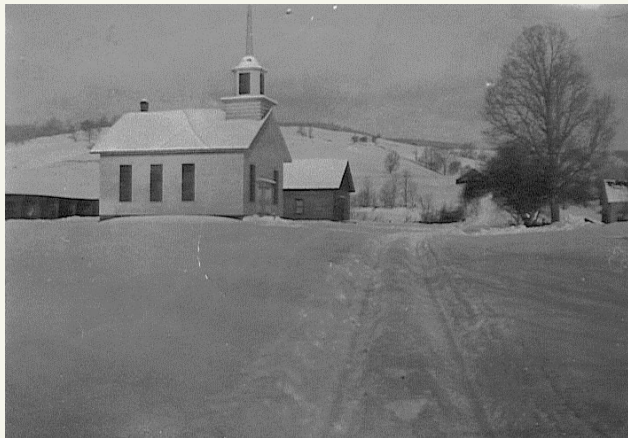
Photo of the South Duxbury church taken in 1908.

Both structures have been listed on the Vermont Register of Historic Places since 1990. The two buildings are very different. The church is much older, (built in 1855), but it is also in much better condition. We shall certainly strive to keep and even improve its 19th century aesthetic. It's fun to imagine the many types of events that could be held there during Society, school and public gatherings. The Sunshine Hall (built about 1890) has a lot more open space so it will be possible to rework it to accommodate our other planned additions: kitchen and reception area, museum space and a record storage area for research. A restroom in Sunshine Hall is also sorely needed. An addition for Sunshine Hall will probably be needed to accomplish all of this. There is presently no water or septic service to